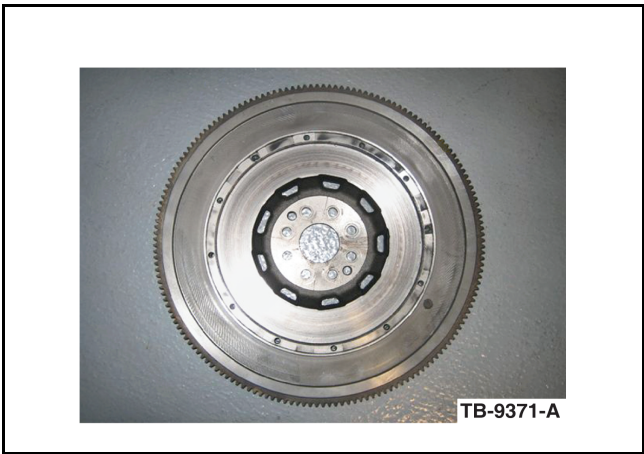
Figure 6 - Article 10-3-8