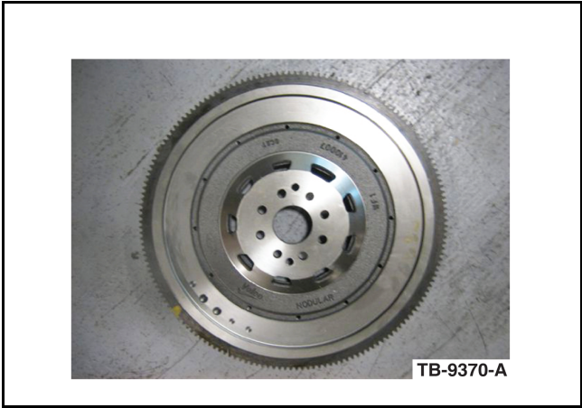
Figure 5 - Article 10-3-8