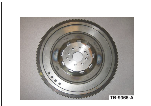
Figure 1 - Article 10-3-8