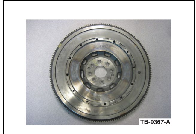
Figure 2 - Article 10-3-8