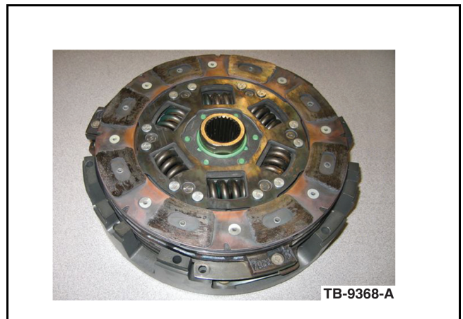
Figure 3 - Article 10-3-8